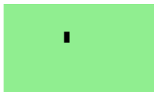
Figure 12.20.: Snake

This is the popular snake game. The aim is to grow your snake as large as possible by eating the dots that appear on the screen. The game will end when the snake touches either the borders of the screen or itself.