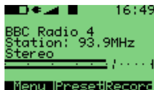
Figure 5.4.: The FM radio screen

This menu option switches to the radio screen. The FM radio has the ability to remember station frequency settings (presets). Since stations and their frequencies vary depending on location, it is possible to load these settings from a file. Such files should have the filename extension .fmr and reside in the directory /.rockbox/fmpresets (note that this directory does not exist after the initial Rockbox installation; you should create it manually). To load the settings, i.e. a set of FM stations, from a preset file, just