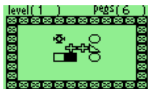
Figure 12.13.: pegbox

To beat each level, you must destroy all of the pegs. If two like pegs are pushed into each other they disappear except for triangles which form a solid block and crosses which allow you to choose a replacement block.