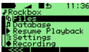
Figure 5.1.: The main menu

The MAIN MENU is the screen from which all of the Rockbox functions can be accessed. This is the first screen you will see when starting Rockbox. To return to the MAIN MENU, press the F1 button.