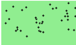
Figure 12.38.: Have you ever seen snow falling?

This demo replicates snow falling on your screen. If you love winter, you will love this demo. Or maybe not. Press On or Off to quit.