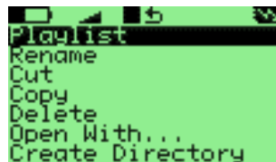
Figure 4.2.: The Context Menu

The CONTEXT MENU allows you to perform certain operations on files or directories. To access the CONTEXT MENU, position the selector over a file or directory and access the context menu with Long Right .