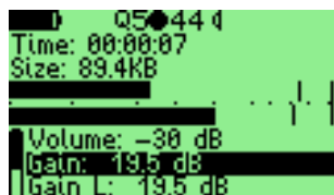
Figure 5.3.: The while recording screen

Selecting the RECORDING option in the MAIN MENU enters the RECORDING SCREEN, whilst pressing Long Right enters the RECORDING SETTINGS (see section 10 (page 64)). The RECORDING SCREEN shows the time elapsed and the size of the file being recorded. A peak meter is present to allow you set gain correctly. There is also a volume setting, this will only affect the output level of the player and does not affect the recorded sound. If enabled in the peak meter settings, a counter in front of the peak meters shows the number of times the clip indicator was activated during recording. The counter is reset to zero when starting a new recording.