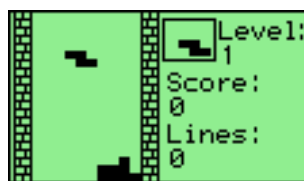
Figure 10.16.: Rockblox

Rockblox is a Rockbox version of the classic falling blocks game from Russia. The aim of the game is to make the falling blocks of different shapes form full rows. Whenever