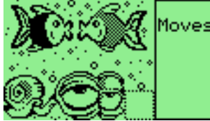
Figure 10.19.: Sliding puzzle

The classic sliding puzzle game. Rearrange the pieces so that you can see the whole picture, or switch to number tiles if you like it a little easier. Includes one picture puzzle. You can also use the sliding puzzle plugin as a viewer for supported image types, to turn your own pictures into a puzzle.