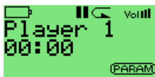
Figure 10.10.: Chess Clock

The chess clock plugin is designed to simulate a chess clock, but it can be used in any kind of game with up to ten players.