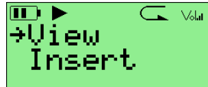
Figure 4.5.: The Playlist Submenu

The PLAYLIST SUBMENU is a submenu in the CONTEXT MENU (see section 4.1.2 (page 19)), it allows you to put tracks into a “dynamic playlist”. If there is no music currently playing, Rockbox will create a new dynamic playlist and put the selected track(s) into it. If there is music currently playing, Rockbox will put the selected track(s) into the current playlist. The place in which the newly selected tracks are added to the playlist is determined by the following options: