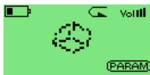
Figure 10.4.: Cube

This is a rotating cube screen saver in 3D.