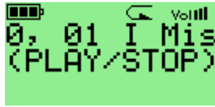
Figure 5.2.: The list bookmarks screen

If the SAVE A LIST OF RECENTLY CREATED BOOKMARKS option is enabled then you can view a list of several recent bookmarks here and select one to jump straight to that track.