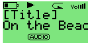
Figure 4.4.: The track info viewer

This screen is accessible from the WPS screen, and provides a detailed view of all the identity information about the current track. This info is known as meta data and is stored in audio file formats to keep information on artist, album etc. To access this screen, press Long Play to access the WPS CONTEXT MENU and select SHOW TRACK INFO. Use Minus and Plus to move through the information.