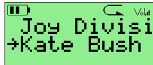
Figure 4.1.: The file browser

Rockbox lets you browse your music in either of two ways. The FILE BROWSER lets you navigate through the files and directories on your player, entering directories and executing the default action on each file. To help differentiate files, each file format is displayed with an icon.