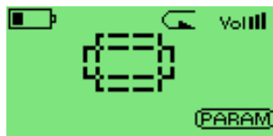
Figure 10.5.: Mosaïque

This simple graphics demo draws a mosaic picture on the screen of the player.