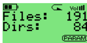
Figure 10.12.: The stats-plugin

The stats plugin counts the directories and files (the total number as well as the number of audio, playlist, image and video files) on your player. Press Menu or Long Menu to abort counting and exit the plugin. Press it again to quit after counting has finished.