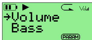
Figure 6.1.: The sound settings screen

The sound settings menu offers a selection of sound settings you may change to customise your listening experience.