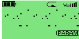
Figure 10.6.: Have you ever seen snow falling?

This demo replicates snow falling on your screen. If you love winter, you will love this demo. Or maybe not. Press Menu or Long Menu to quit.