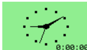
Figure 12.49.: Clock

This is a fully featured analogue and digital clock plugin.