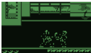
Figure 12.45.: ZXBox

ZXBox is a port of the “Spectemu” ZX Spectrum 48k emulator for Rockbox ( https://sourceforge.net/projects/spectemu/ ). To start a game open a tape file or snapshot saved as .tap , .tzx , .z80 or .sna in the file browser.