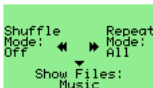
Figure 4.5.: The F2 quick screen