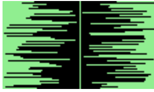
Figure 12.35.: Oscilloscope

This demo shows the shape of the sound samples that make up the music being played.