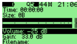
Figure 5.3.: The while recording screen

Selecting the RECORDING option in the MAIN MENU enters the RECORDING SCREEN, whilst pressing Long Play enters the RECORDING SETTINGS (see section 10 (page 69)). The RECORDING SCREEN shows the time elapsed and the size of the file being recorded. A peak meter is present to allow you set gain correctly. There is also a volume setting, this will only affect the output level of the player and does not affect the recorded sound. If enabled in the peak meter settings, a counter in front of the peak meters shows the number of times the clip indicator was activated during recording. The counter is reset to zero when starting a new recording.