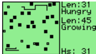
Figure 12.27.: Wormlet game

Wormlet is a multi-user multi-worm game on a multi-threaded multi-functional Rockbox console. You navigate a hungry little worm. Help your worm to find food and to avoid poisoned argh-tiles. The goal is to turn your tiny worm into a big worm for as long as possible.